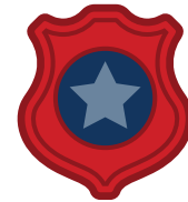
Notify local law enforcement